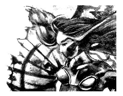
INTERNATIONAL NETWORK OF COUNTER-INFORMATION & TRANSLATION

The list is never complete.. play your part..